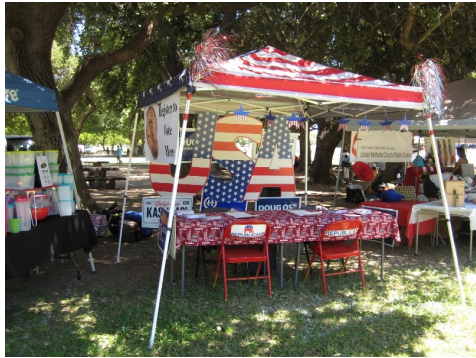
Our booth – front and back: