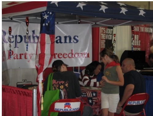
Some of the folks we registered.